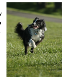
"Vic, our specially trained Border Collie, is ready to control the geese at your property."

Each goose on a property leaves one to three pounds of droppings per day.